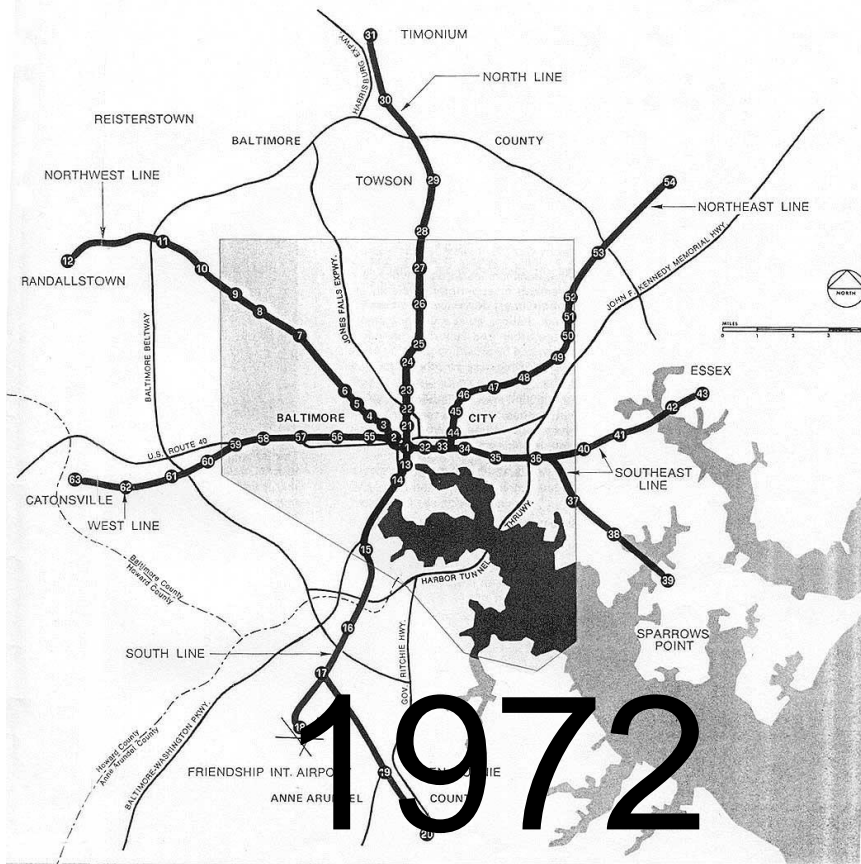
-1. Baltimore Region rapid transit system routes and station locations.