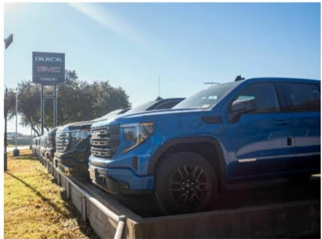
GMC pickup trucks on a lot at a General Motors dealership in Austin, Texas. The average U.S. passenger vehicle has gotten about 8 inches taller in the last 30 years, according to the Insurance Institute for Highway Safety.